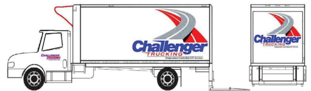
Refrigerated Straight Truck (With Lift Gate)